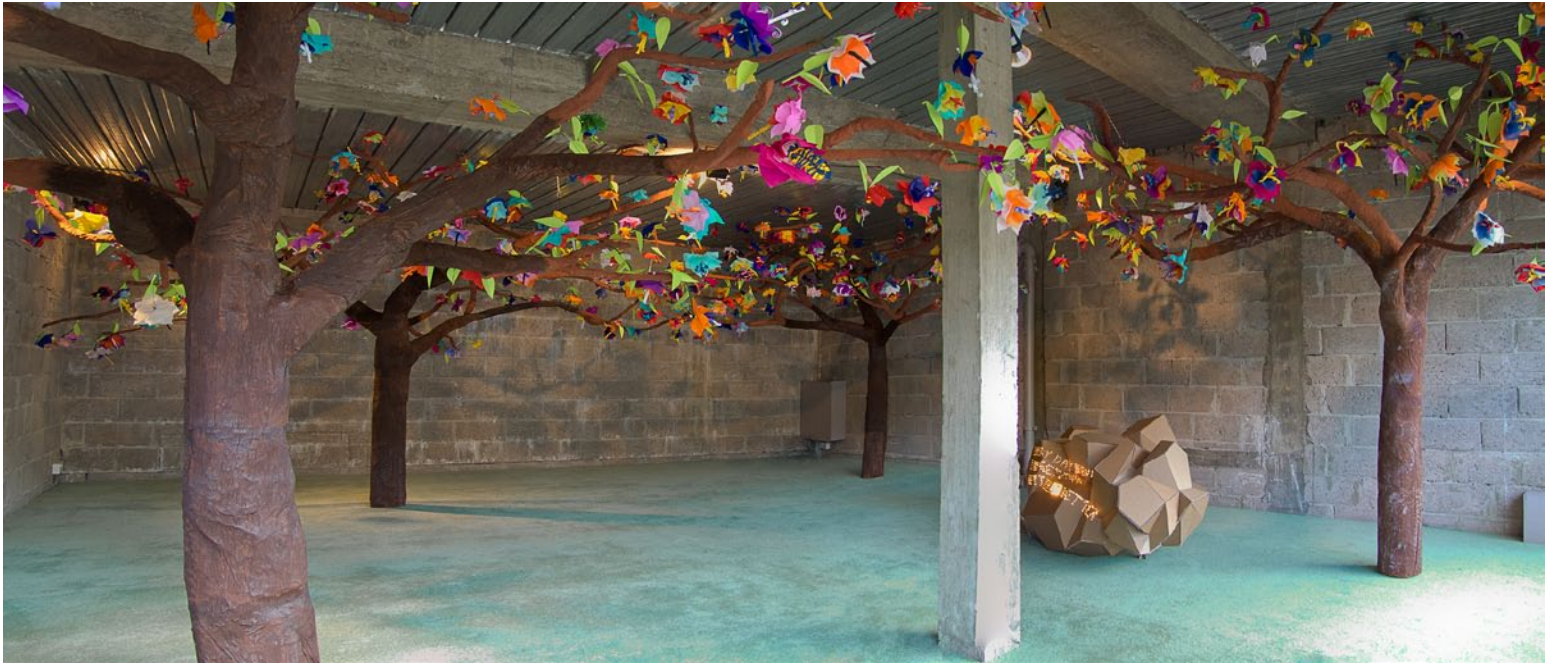
Above: “All the time I was making this I was thinking of you” , 2007. Mixed media installation. Below: “Untitled (life is good)” , 2007. Mirror, cement, carpet, wood.