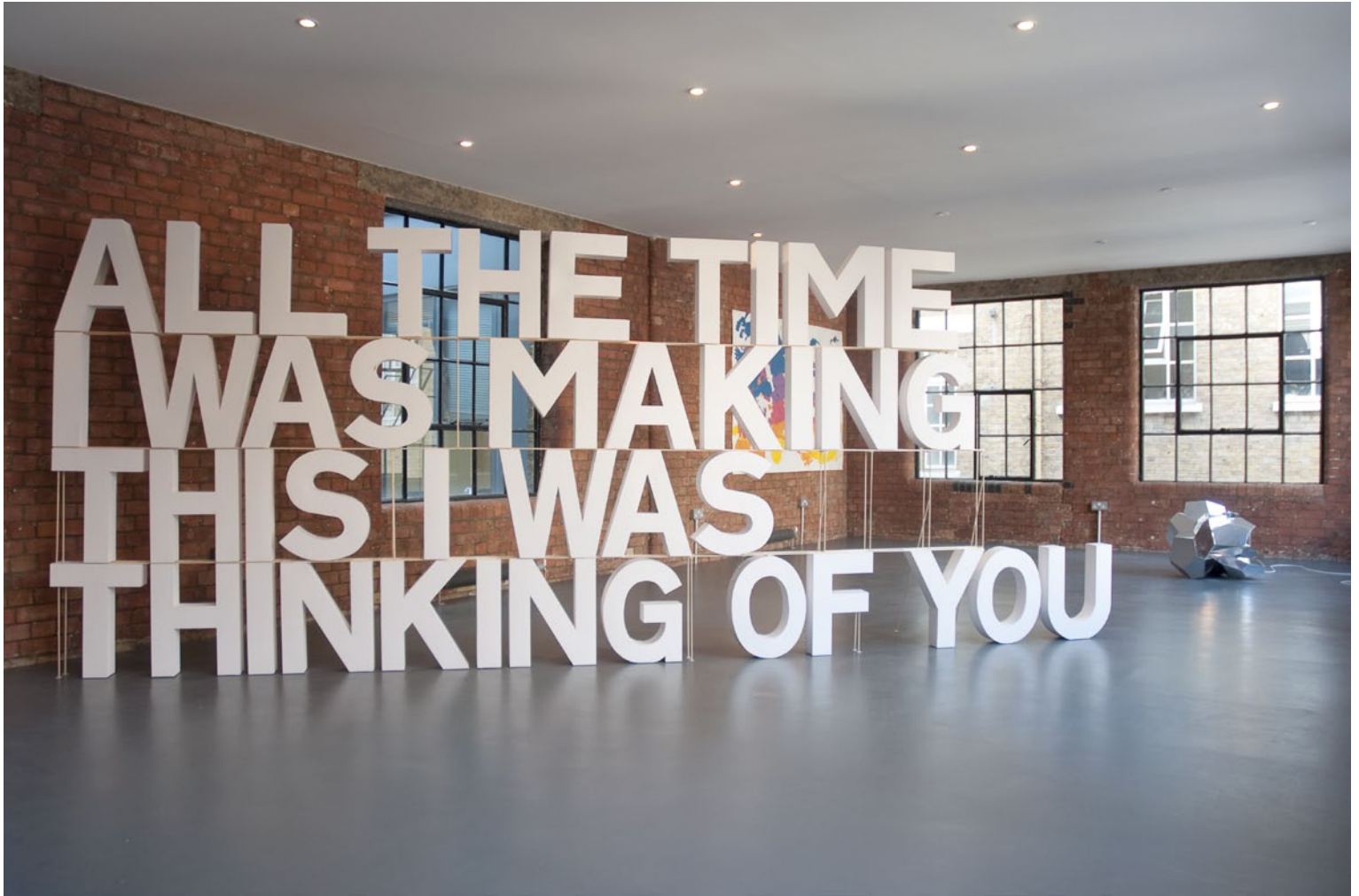
Above: Installation shot, foreground: 'Untitled (please don't break my heart)' 2009 Below: Untitled drawing, 2009