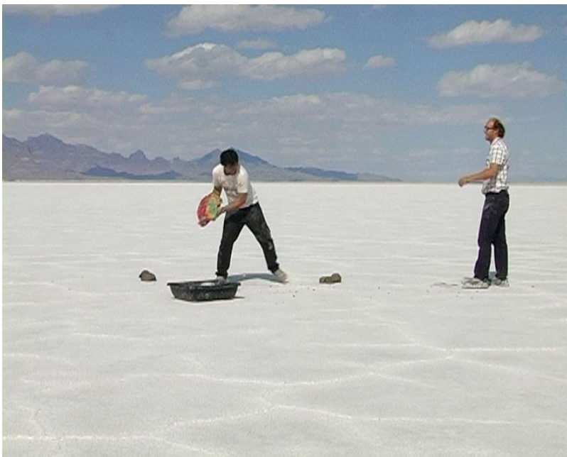
Left: “The object moved by its own success” (video still) October 2008

This image shows a frame from a one hour performance-to-camera video, shot on the Bonneville Salt Flats, Utah.