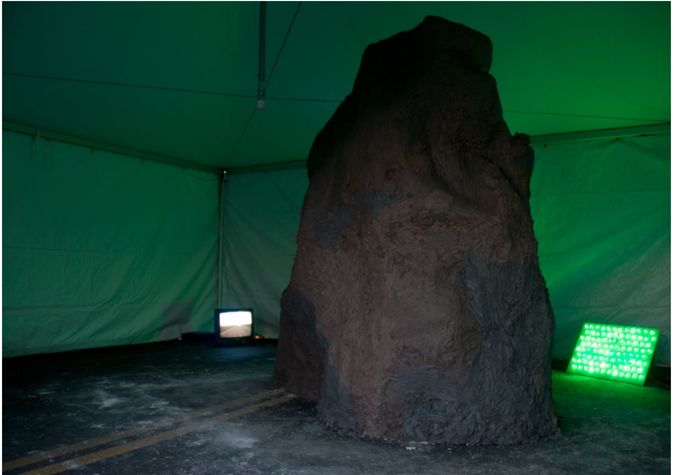
Above: "Untitled (First Friday Las Vegas)" , mixed media installation, 2008