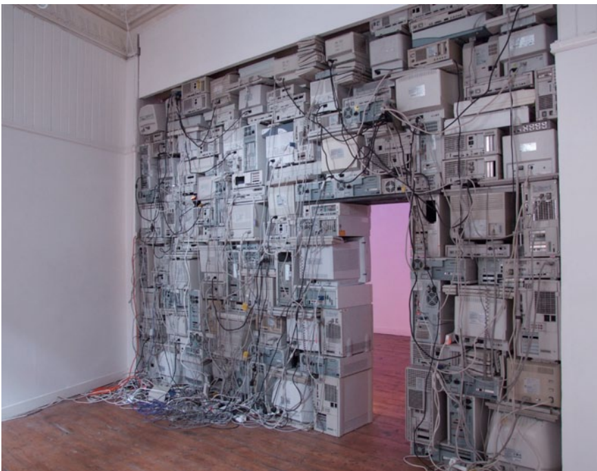
“Mauritian Sunset”, 2006. Assorted computer equipment.

This installation, exhibited at Edinburgh’s Embassy Gallery, was the final incarnation of a series of works using a collected stockpile of discarded and redundant computer equipment.