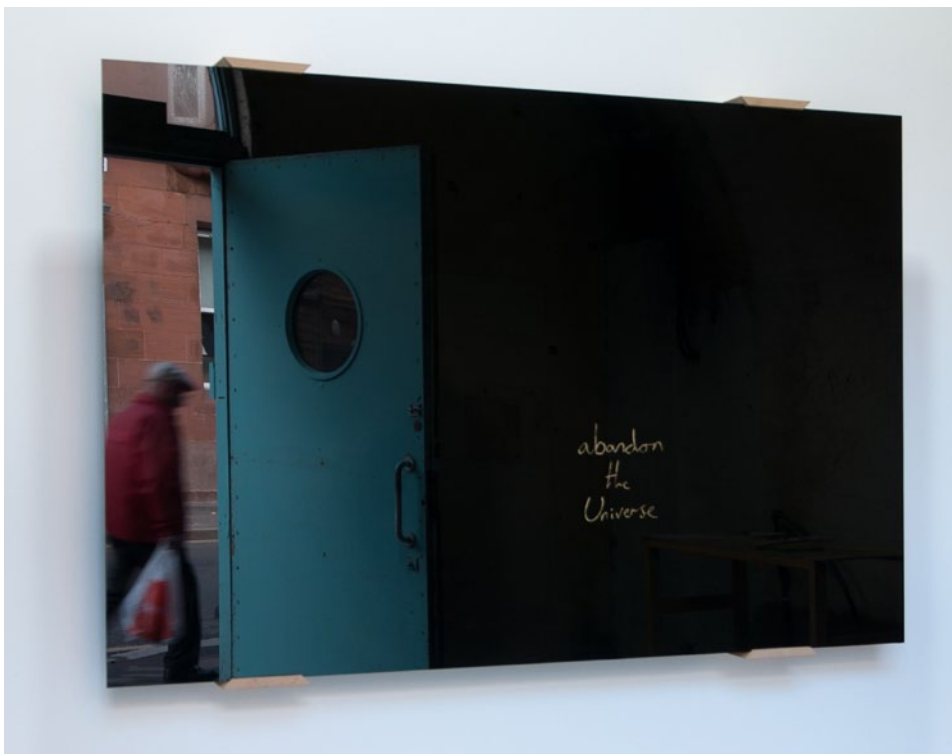
Below: "Abandon the universe" , Gold paint on black glass, 2010

These two photographs document my most recent solo exhibition, "Better World", commissioned for the Glasgow International 2010 Festival of Visual Art.