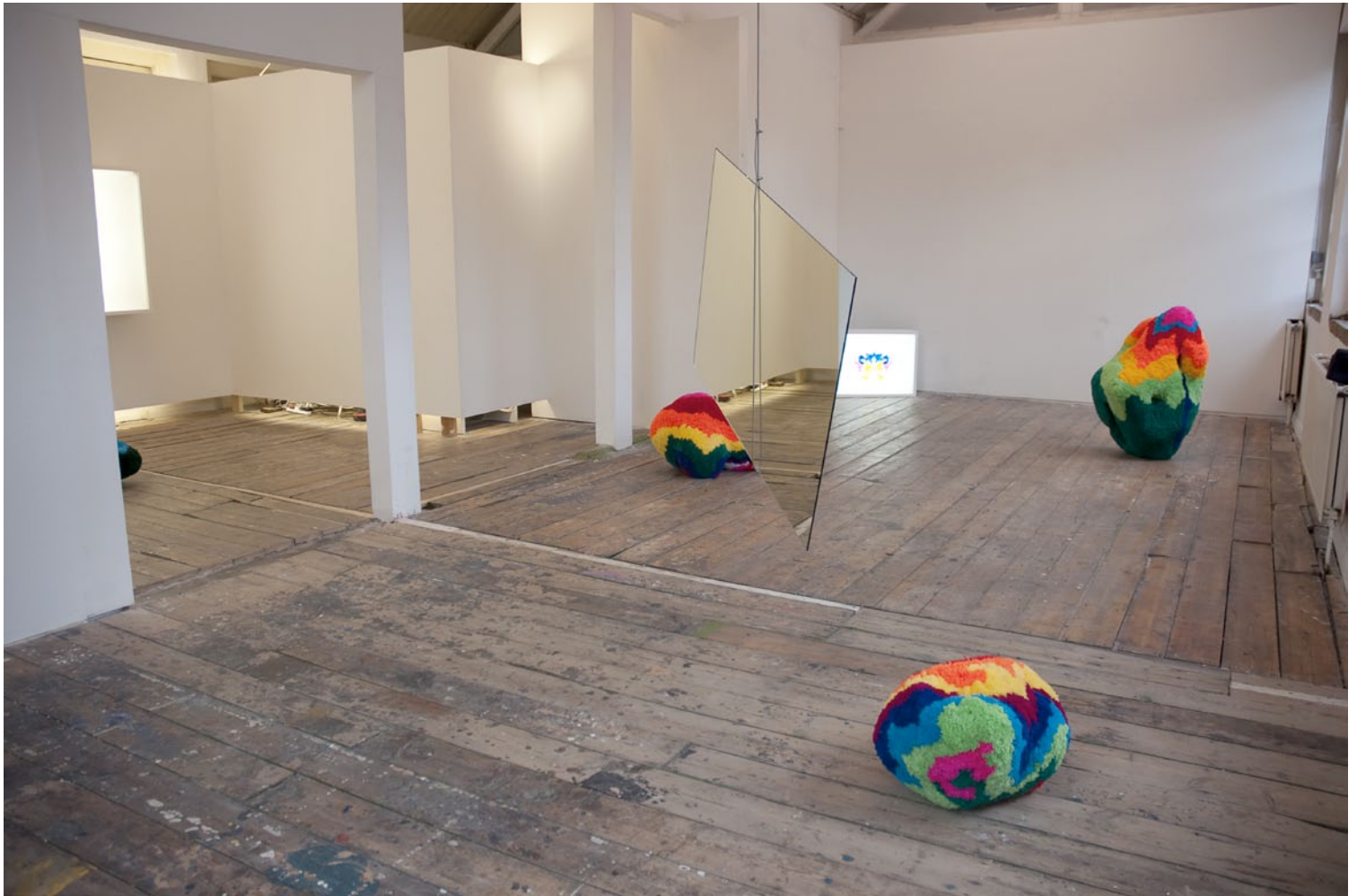
Above: "Pure Love" exhibition Installation shot, 2009 Below: 'You complete me' & 'Pure Love V' , both 2009