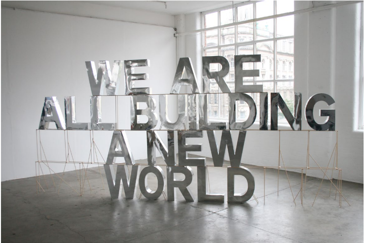
Above: “Untitled (balancing act #2)” , 2008. Mirror card, wooden dowel. 600x220x20 cm

“Untitled (balancing act #2)” was made for a group exhibition at Belfast’s longest running artist-run exhibition space, Catalyst Arts. I was asked to contribute work to a group show that would address the news that the gallery would shortly be closed down and demolished to make way for a redevelopment of the city centre.