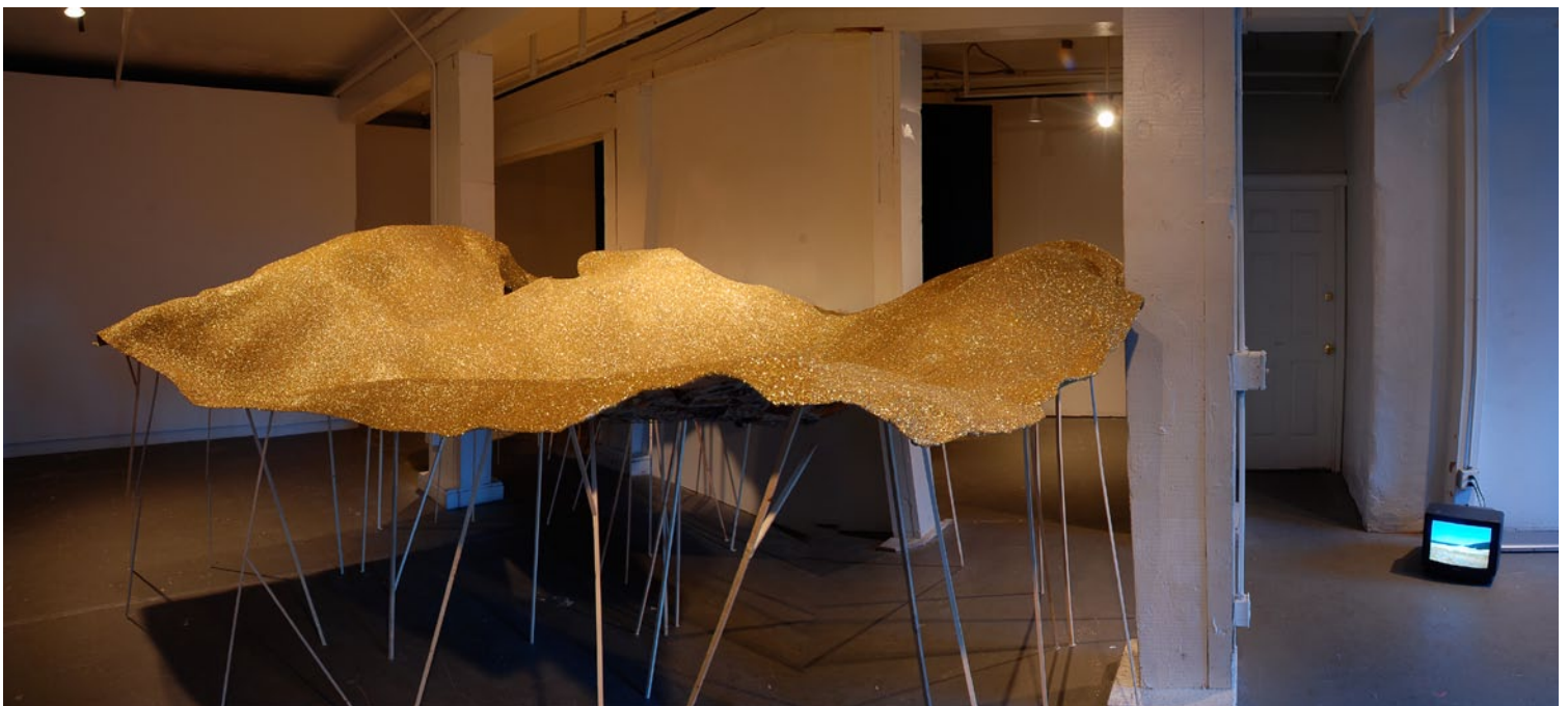
Below: "Waiting for reoccurrence" , mixed media installation, 2008