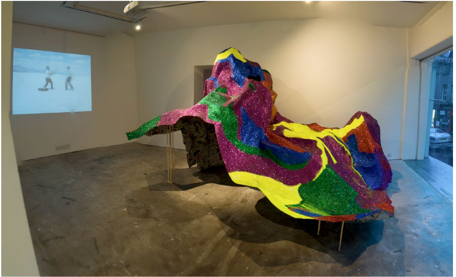
“The object moved by its own success (II)” , December 2008. Collective Gallery, Edinburgh, 2008 Two room installation: video, glitter, papier-mâché, pine, concrete