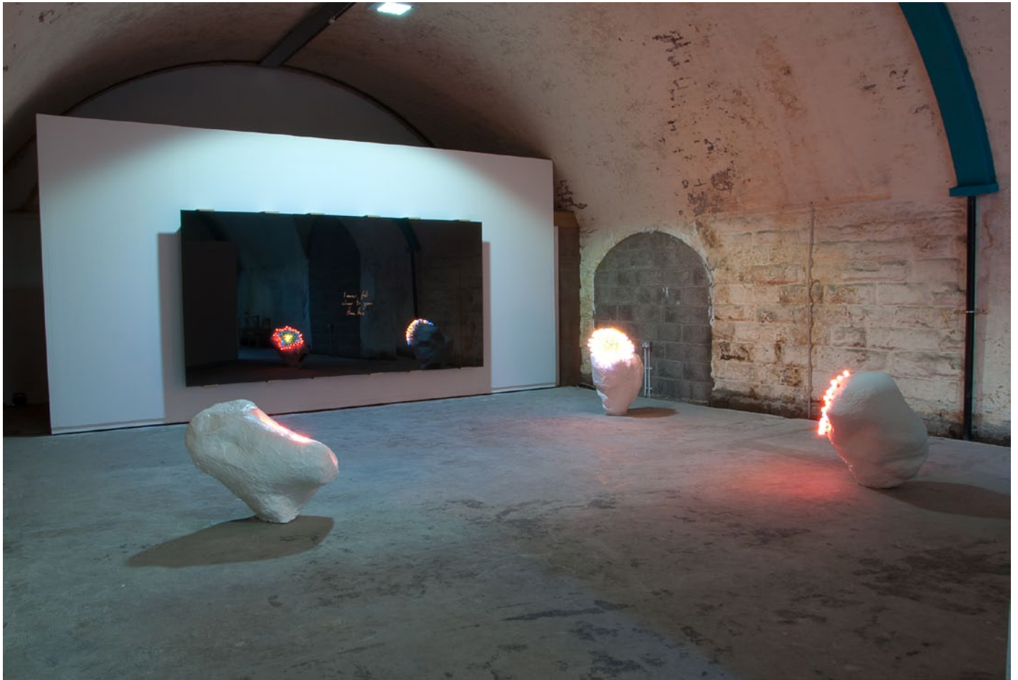
Above: "Better World" installation shot, 2010