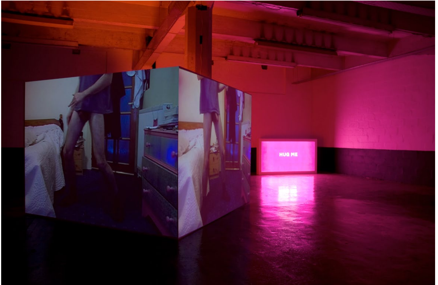
Above & below: "Sapere Aude" , 2007 Lightboxes, text, mirror, three-channel video projection, floor varnish